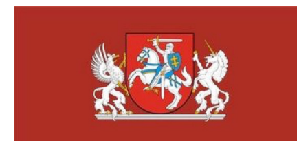
PRESIDENT OF THE REPUBLIC OF LITHUANIA DALIA GRYBAUSKAITĖ

Conference is held under the patronage of the President of the Republic of Lithuania H.E. Dalia Grybauskaitė